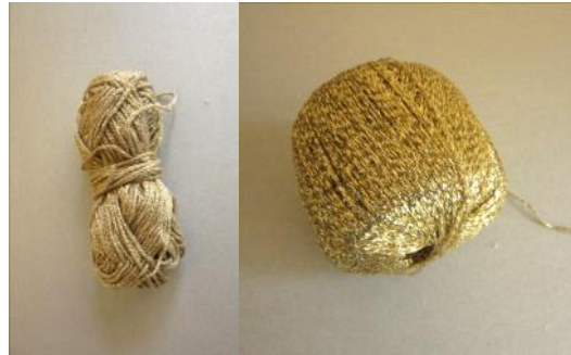
Ecrù Yarn (of your choice) Golden Lamè Yarn