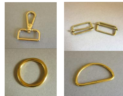
1 Swivel snap hook - 2 Sliders 2 Rings - 2 D-rings