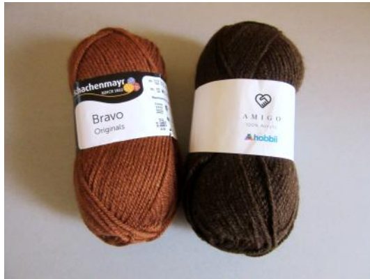
100% Acrylic Wool Crochet Hook 3.50 mm