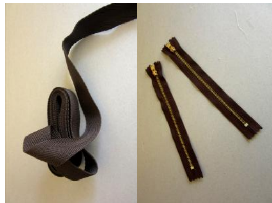
Webbing 2 Zippers