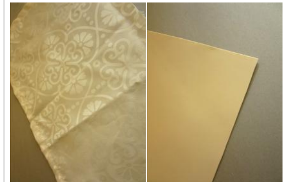
Lining Eva Rubber Sheet (2 mm)